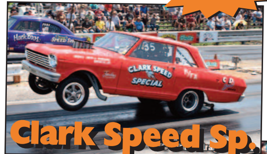
Clark Speed Sp.